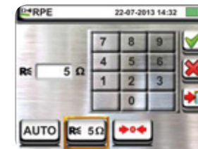
Selection of maximum resistance value