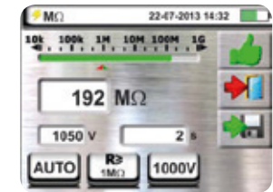
Insulation measurement outcome