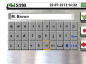
Entering comments on measurements