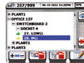
Saving with file tree