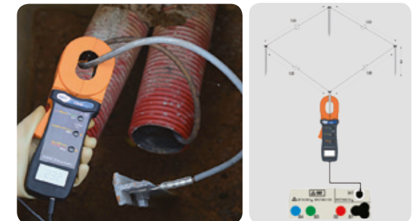
Measurement with clamp T2100