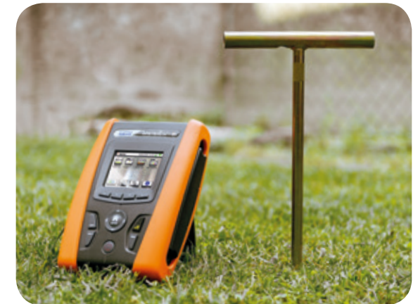
Earth resistance measurement by Volt-ampere method

It measures soil resistivity ( \rho ) with 4-pole Wenner method.