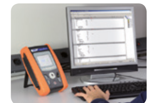
Transfer of data to PC by TopView software