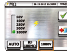
Selection of test voltage and minimum limit value