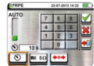
Selection of AUTO or TIMER measuring mode